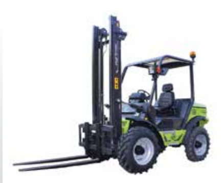
TH-175 C Series 1,700 kg